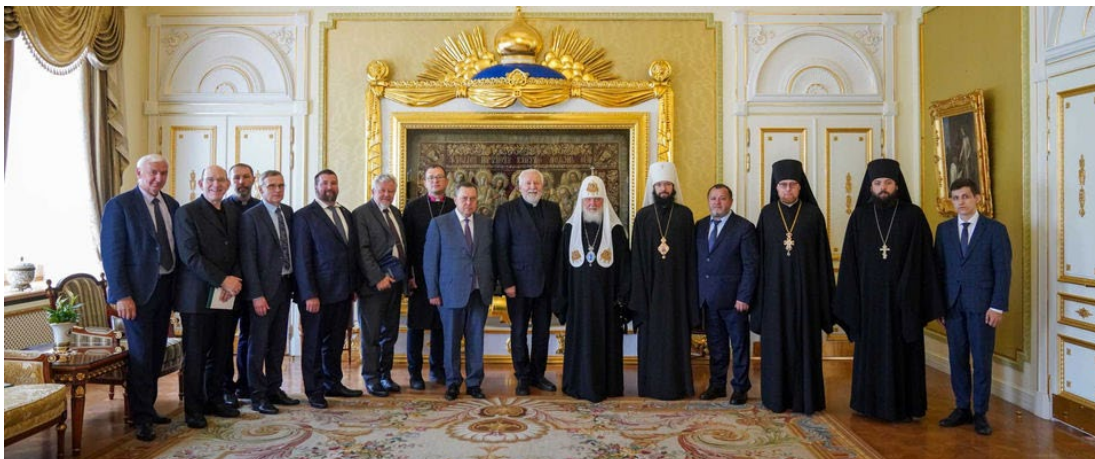
The head of Russian Orthodoxy, Kirill, met with the Protestant leaders in June.

On June 18, 2024, Kirill met with the leaders of Russian Protestant associations, where he spoke about the unity of the Orthodox and Protestants in Russia in support of the policy of their country, and mentioned the persecution of the Orthodox subservient to the Moscow Patriarchate in Ukraine. ( https://mospat.ru/en/news/91890/ ) It is necessary to note that those priests subservient to the Russian Orthodox Church in Ukraine who clearly called for the overthrow of the legitimate government of Ukraine, justified Russian aggression, and cooperated with and assisted the Russian invading army that bombs Ukrainian homes, were detained as collaborators under the law of Ukraine. All Christian denominations in Ukraine have complete religious freedom and the authorities do not interfere with them. On the contrary, the Russians persecute Ukrainian Christians in the occupied territories.