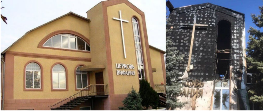
Destroyed Baptist “Bethany Church” building in Mariupol after the Russian army besieged the city for a few months in the spring of 2022.

What is the “Russian world”? War and aggression are cynically called a “holy war.” The head of Russian Orthodoxy declares that the Russian Federation is a “restrainer” of evil; at the same time the Russian army carries out evil, shelling children's hospitals with rockets, and bombing Ukrainian cities and villages every day. The Russians describe the countries that help Ukraine in its defense against military aggression as “fallen into Satanism.”