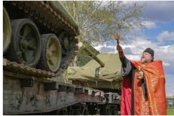
Russian Orthodox priests sprinkle “holy water” on military tanks, deployed to fight in Ukraine.

context of the Epistle, the apostle Paul speaks of restraining evil. What does the word “restrainer” mean in the Bible and in what sense did the Russians use it in their document? The apostle Paul did not specifically name someone or something, but rather used it as a generalized word. Therefore, there are several interpretations among notable biblical commentators that the restraining of evil can happen through the Holy Spirit, a church, or a spiritual force. For Christians who know the 2 nd Epistle of the apostle Paul to the Thessalonians, it seems very strange that the head of Russian Orthodoxy described the Russian Federation as “restrainer.” This shows either a deliberate twisting of the Holy Scriptures or a complete misunderstanding of it. Such a statement indicates a gross use of the Bible for political manipulation, where the Russian Federation is equated with the Holy Spirit or God's church.